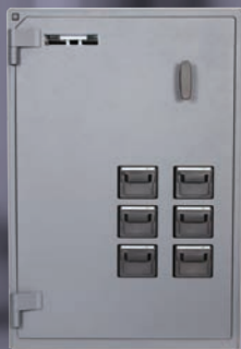
Bulk Coin and Note Dispenser