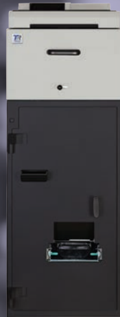
Medium Coin Recycler