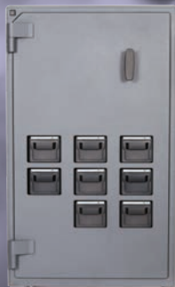
8 Cup Bulk Coin Dispenser