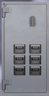
6 Cup Bulk Coin Dispenser

https://www.tidel.com/products/smart-safes/series-4e/