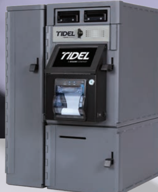
Narrow Side Vault