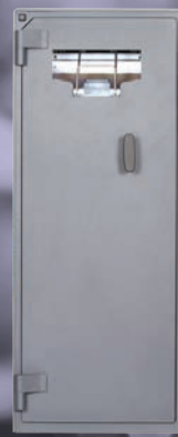
4 High Capacity Note Dispenser