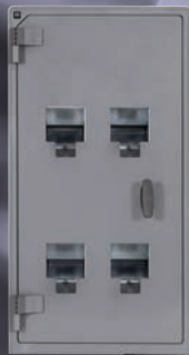
Rolled Coin Dispenser