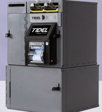
Till Storage Vault