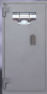
3 High Capacity Note Dispenser