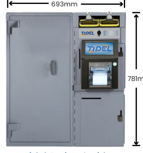
Tidel Series 4 with Standard Side Vault