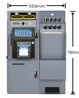
Tidel Series 4 with Tube Vend

Tube Vend or two sizes of Side Vaults currently available. All require either a Storage Vault or Mailbox Drop Vault.