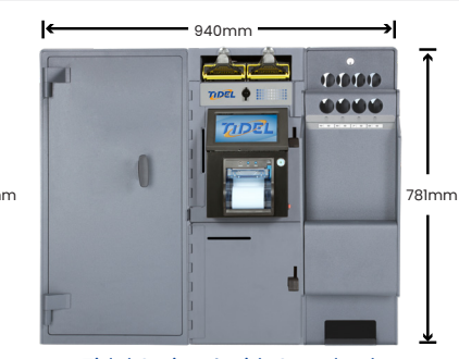
Tidel Series 4 with Standard Side Vault and Tube Vend