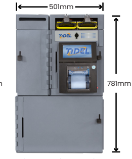
Tidel Series 4 with Till Storage Vault